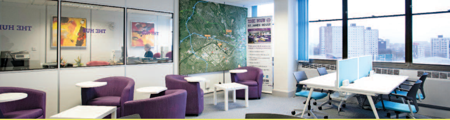
shared business lounge, THE HUB